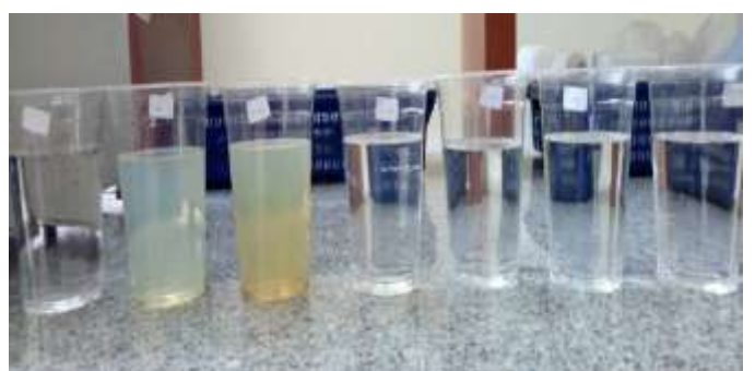
Figure 1. Examination of Tahongai leaves in killing larvae of Anopheles sp.

An increase in percent mortality of test larvae was in accordance with the increased concentration of Tahongai leaf extract which was exposed to the test larvae for 24 hours. Concentration of 0.5 mg/mL with 68% larval mortality as much as 68% of larvae, concentration of 1 mg/mL with 88% larval mortality of larvae, concentration of 2 mg/mL of larval mortality of 100% larvae, concentration of 4 mg/mL percent of mortality larvae as much as 100% larvae, and at a concentration of 8 mg/mL percent mortality of larvae as much as 100% larvae.