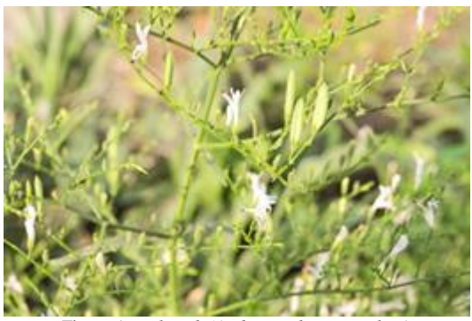
Figure 1. Kalmegh (Andrographis paniculata)